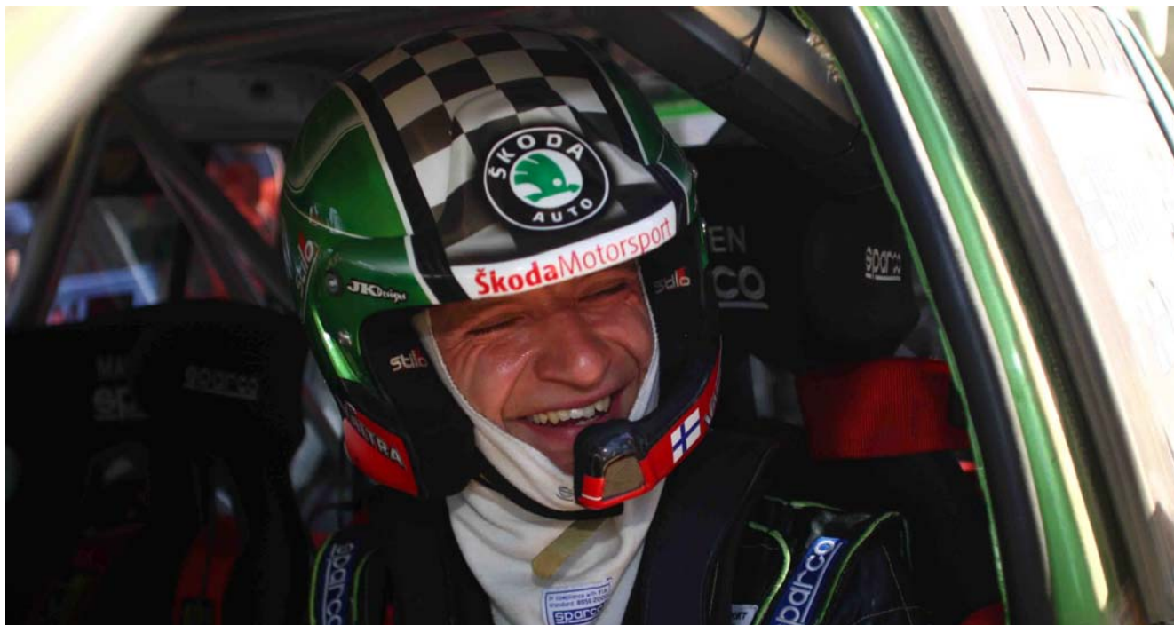
Juho Hanninen won Rally d'Italia-Sardegna with Stilo

Following last weekend's gravel-based Rally d'Italia-Sardegna, Skoda is set to take part on the asphalt-based Geko Ypres Rally in Belgium from 24-26 June.