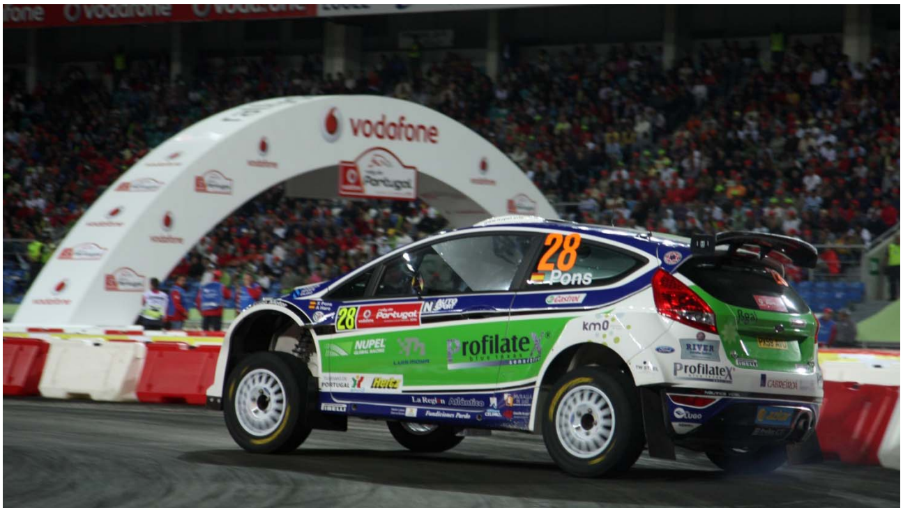
Xevi Pons is on control of the SWRC with Stilo helmets

Pons returns to SWRC action on Rallye Deutschland in August after he elected not to include Rally Finland as one of his scoring rounds.